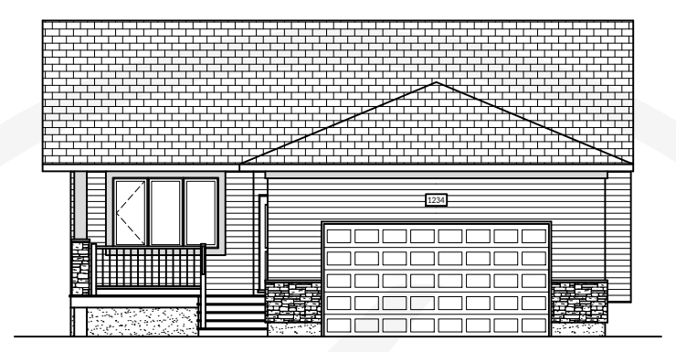
ARTIST'S REPRESENTATION - EXTERIOR MAY VARY