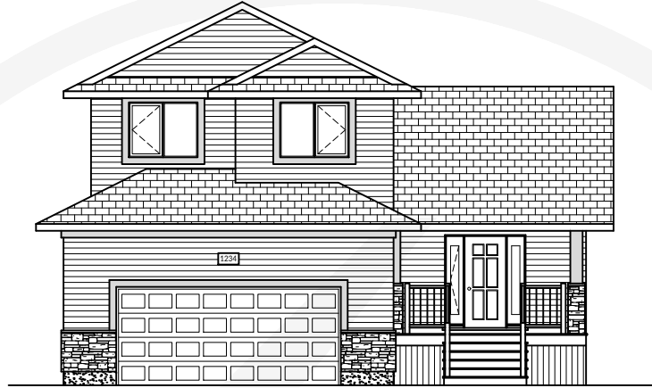
ARTIST'S REPRESENTATION - EXTERIOR MAY VARY