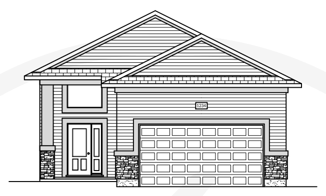
ARTIST'S REPRESENTATION - EXTERIOR MAY VARY