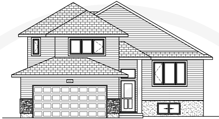
ARTIST'S REPRESENTATION - EXTERIOR MAY VARY