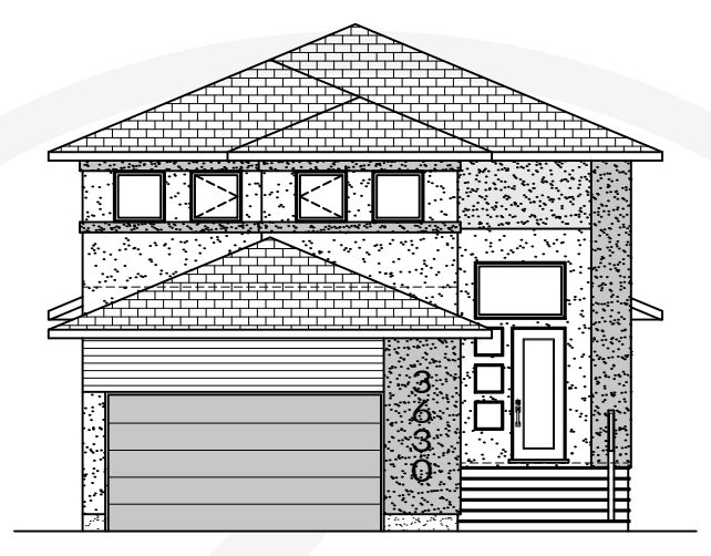
ARTIST'S REPRESENTATION - EXTERIOR MAY VARY