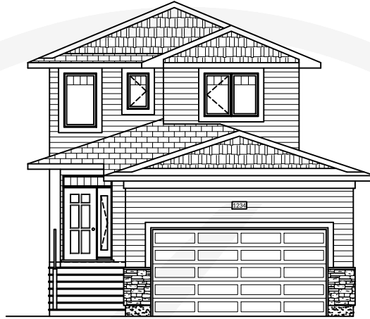
ARTIST'S REPRESENTATION - EXTERIOR MAY VARY